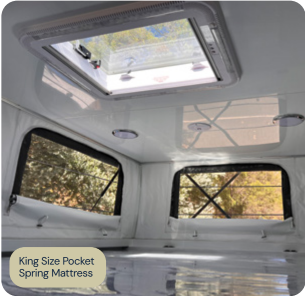
King Size Pocket Spring Mattress

*Registrations, Dealer and Delivery charges may apply