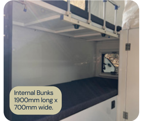
Internal Bunks 1900mm long x 700mm wide.