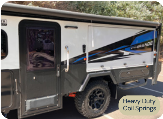
Heavy Duty Coil Springs