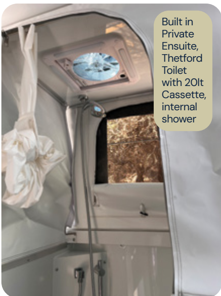
Built in Private Ensuite, Thetford Toilet with 20lt Cassette, internal shower