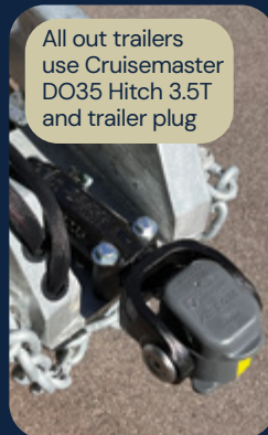
All out trailers use Cruisemaster DO35 Hitch 3.5T and trailer plug