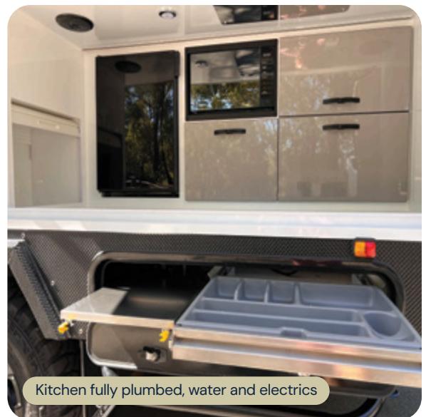
Kitchen fully plumbed, water and electrics