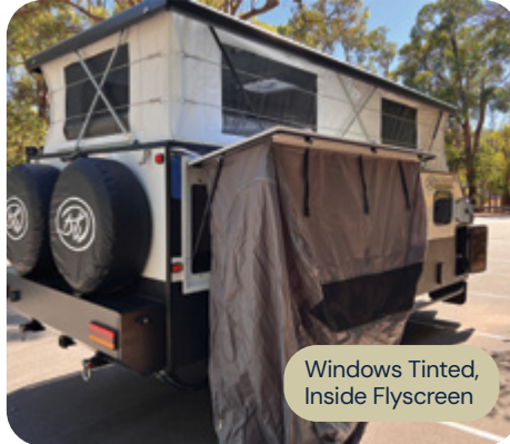
Windows Tinted, Inside Flyscreen